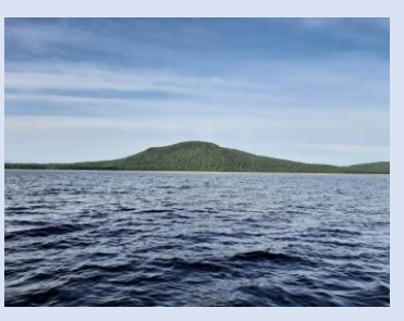
The Source: Big Wood Pond holds 17.8 million gallons of water

Presently, JUD employs 4 staff members with a total of 29 combined years of service. Not to mention, a board of trustees comprised of 5 members with 23 combined years of experience. According to Sara, the staff's proficiency stems from their well written and updated SOPs on their daily, weekly, monthly, and annual tasks. The employees complete tasks efficiently because of good communication and teamwork.