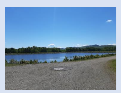
One of JUD's six facultative wastewater lagoons